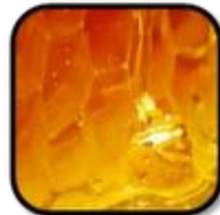
RIVERS OF HONEY