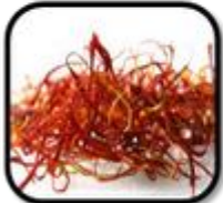
SAND OF SAFFRON