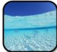
RIVERS OF WATER