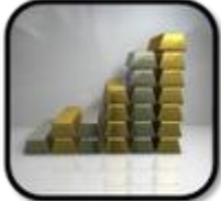
BRICKS OF GOLD AND SILVER