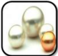
TENTS MADE OF PEARL