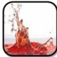
RIVERS OF NON- INTOXICATING WINE