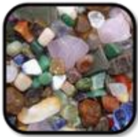
PEBBLES AND STONES OF PRECIOUS GEMSTONES