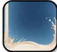
RIVERS OF MILK